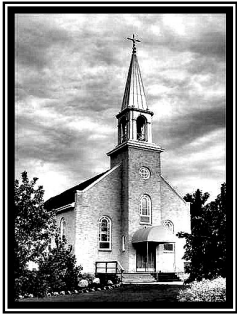
Blessed Sacrament Church