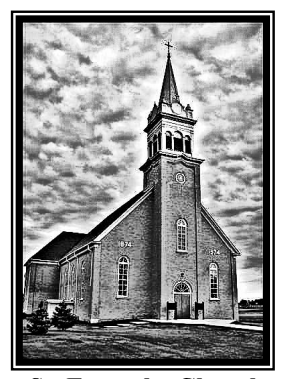
St. Eustache Church