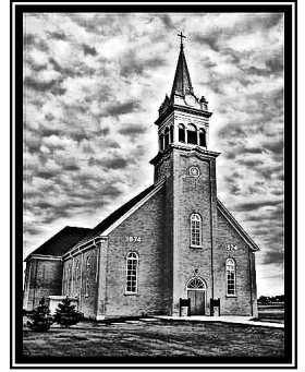
St. Eustache Church