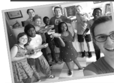
AT BLESSED SACRAMENT CHURCH

SPECIAL ACTIVITY on FRIDAY August 17th at 3:30 pm: PRESENTATION by the children of the Camp for parents, parishioners and friends. (snack will follow)