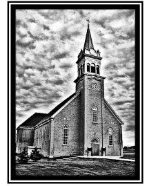
St. Eustache Church