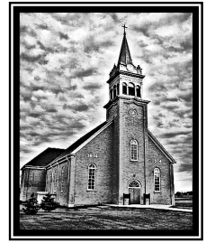
St. Eustache Church