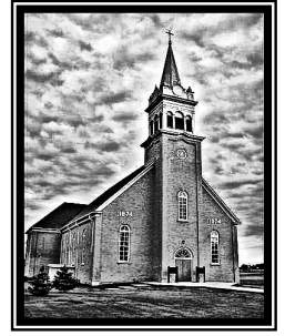
St. Eustache Church