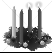
Blessed Sacrament Church